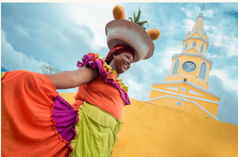
Meet the friendly people of Colombia