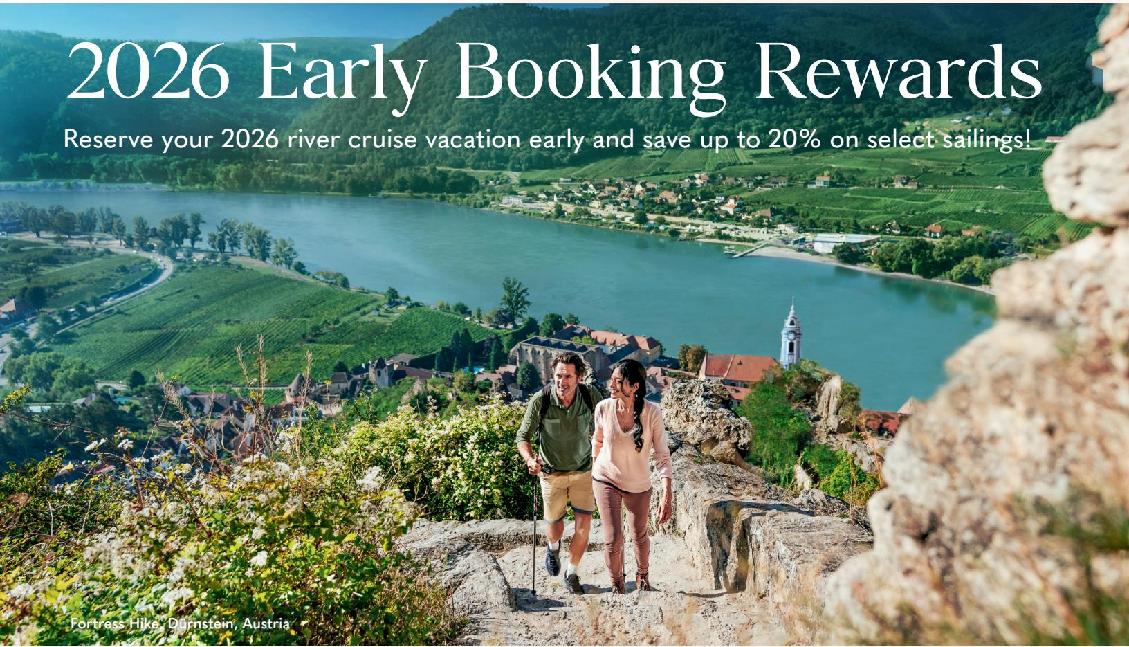
Fortress Hike, Dürnstein, Austria

Reserve your 2026 river cruise vacation early and save up to 20% on select sailings!