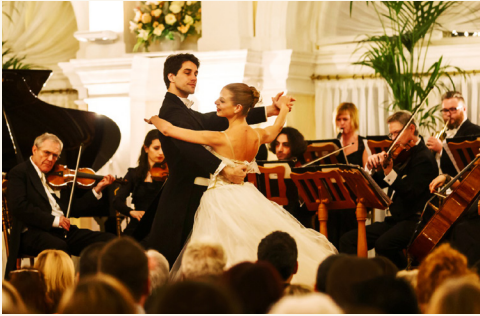
Classical music performance