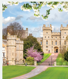
Gems of Southern England 8 Days/7 Nights/11 Meals Starting from $2,843

Unpack once and Dublin will be your home base for discovering Ireland's fun side, including plenty of music and ventures to Ireland's sporting world.