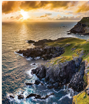
Ireland's Wild Atlantic Way 9 Days/8 Nights/14 Meals Starting from $2,471

Immerse yourself in ancient history and culinary delights as you discover Palermo's vibrant streets, ancient ruins in Agrigento, Taormina's coastal charm, and the majestic landscapes of Mount Etna.