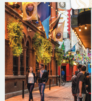
Taste of Britain & Ireland 14 Days/13 Nights/21 Meals Starting from $4,161

Journey through ancient cities: castles, cathedrals, and gardens. See Stonehenge, the Roman Baths, Canterbury Cathedral, Windsor Castle, Blenheim Palace, Leeds Castle, and Kensington Palace.