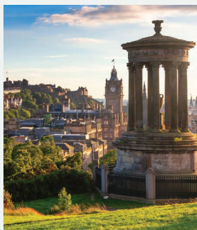
Taste of Scotland 5 Days/4 Nights/7 Meals Starting from $1,346

Explore the very best of Scotland's gorgeous scenery and bustling cities on this short-and-sweet introductory tour. Discover the highlights of Glasgow, the Highlands, and Edinburgh.