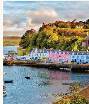
Scottish Isles & Glens 12 Days/11 Nights/18 Meals Starting from $3,481

Discover the untamed nature and rich cultural heritage of Ireland's western coast, with its spectacular ocean vistas, enchanting towns, and craftsmanship deeply rooted in tradition.