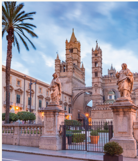
Classic Sicily 8 Days/7 Nights/13 Meals Starting from $1,886

Immerse yourself in ancient history and culinary delights as you discover Palermo's vibrant streets, ancient ruins in Agrigento, Taormina's coastal charm, and the majestic landscapes of Mount Etna.