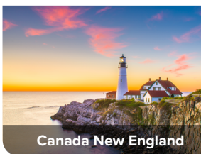
Canada New England